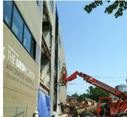
Figure 2: East curtain wall installation.

The rigidity of the URBN Center's construction schedule was a big challenge to the construction team. Due to the nature of the project, the completion of the construction and turn over date was not up for negotiation. The project team needed to turn over the project to the owner before the students had to start their scheduled classes in the URBN Center. Therefore, contingencies forced the project team to perform their work using over time and adding multiple labor shifts in order to maintain the project schedule. Prefabricating the curtain walls will allow for time saving due to shorter installation and possible labor cost savings.