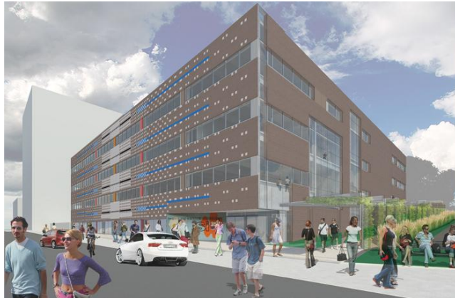
Figure 1: Rendering of the URBN Center ( Property of MS&R LTD )

The URBN Center is a renovation of the famous design of Robert Venturi that is aimed to bring students of the Antoinette Westphal College of Media Arts & design in Drexel University under one roof. The four story building is re-designed to create a great working environment for students who are pursuing an education in Architecture, Arts Administration, Design & Merchandising, Digital Media, Entertainment & Arts